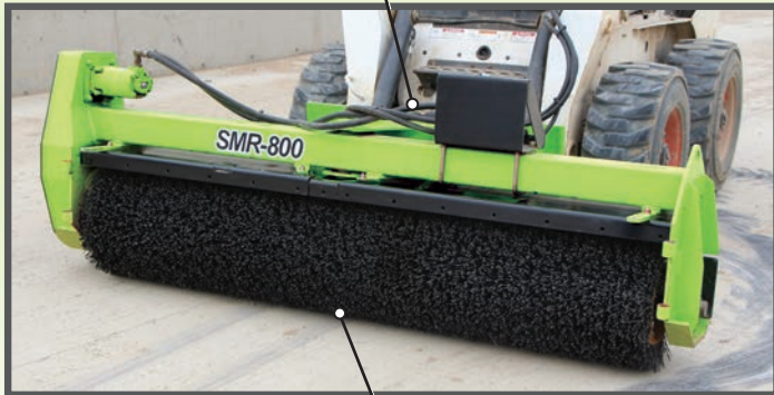
- Optional broom attachment for sweeping parking lots, roads or removing snow -