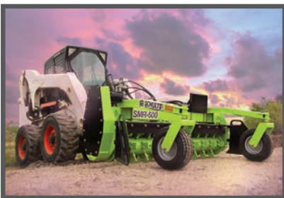
- SMR-600 Shown -