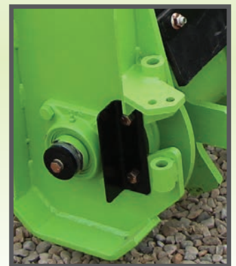
- Heavy duty bearings - Same bearing as used on SRW-1400