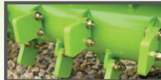
- Replaceable teeth on the SMR-600 -