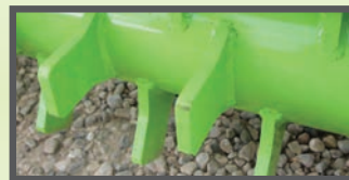
- 4" teeth made from Hardox 450 - For superior wear resistance

Gearbox features reversible tensioner and heavy 80 chain which decreases downtime. The gear ratio has a larger bottom sprocket that increases the mechanical advantage, giving deeper ground penetration and fewer stall outs. Side plates are adjustable, removable, and reversible for varying ground applications.