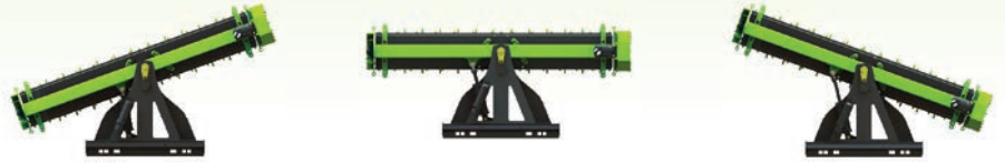
- Drum angle movement 20 degrees left or right -