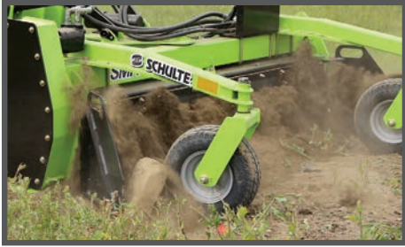
- Great for land use preparation -